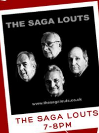
THE SAGA LOUTS 7-8PM