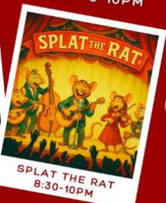
SPLAT THE RAT 8:30-10PM