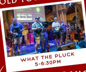
WHAT THE PLUCK 5-6:30PM